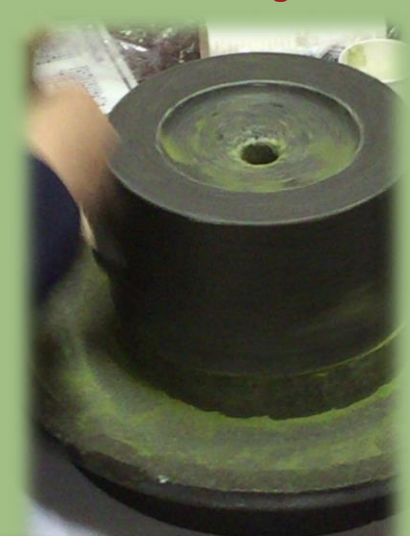
'HIKIUSU' You will learn how to make matcha, green tea powder, with a stone hand mill.

Come and join our special event to experience Japanese traditional life and culture! The following mini-workshops are offered for free in the permanent exhibition room.